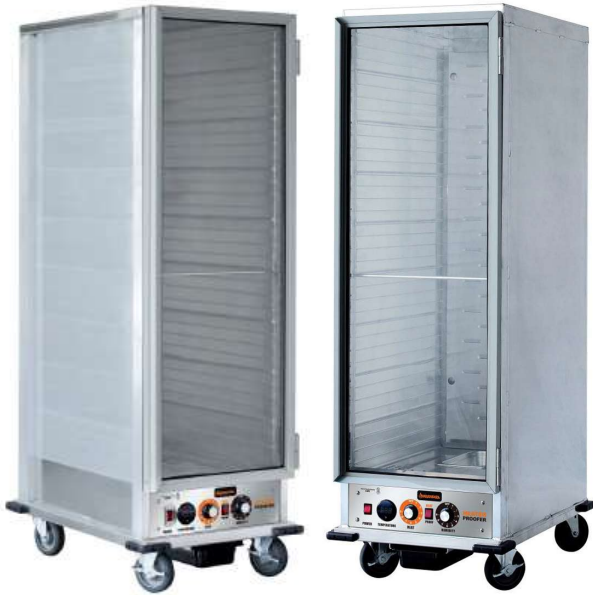
MODEL SHPN (NON-INSULATED)